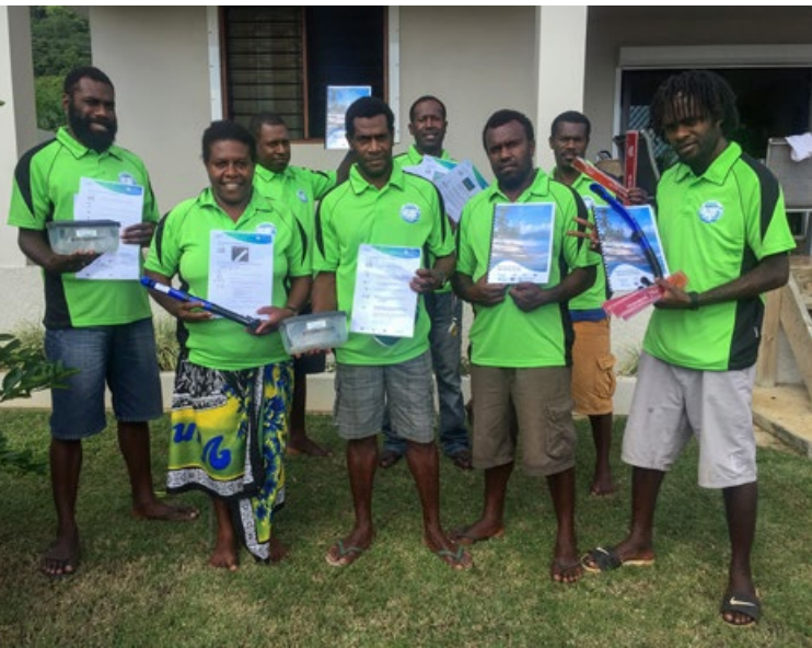
Figure 2. Some of the Vanuatu Marine Champions who are all trained in the six Toolkit modules and lead community training and monitoring sessions.

data monitoring of commercial catches. The catch surveys also focus on size data to inform community decision-making while also collecting catch per unit effort (CPUE) data that provide a long-term data set that is compatible with VFD requirements. Also, the mangrove and seagrass surveys adopt nationally used methods, and the crown-of-thorn starfish (COTS) module links directly with a current national initiative.