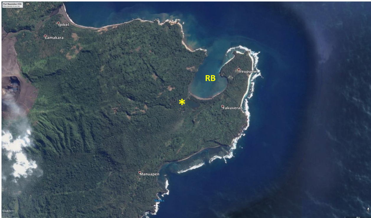
Figure 2. Map of the Port Resolution area shown on the right-hand side of the image. Resolution Bay (RB) and Lake Eweya (*) are each marked. The nearby active volcano, Mt Yasur, can be seen on the far left of the map image.

Water quality parameters of Resolution Bay and Lake Eweya are not readily available however it is reasonable to describe the salinity in the bay to be at or approaching full seawater salinity of 35 ppt, while Lake Eweya is a brackish water environment with salinity varying throughout the year as the lake is periodically opened and closed to the sea due to seasonal rainfall patterns (Welch et al., 2019). Water chemistry is likely to be high in mineral content and sulfates although this may be localised to areas around thermal springs. These springs have been shown to produce acidic waters in Port Resolution, but again their influence may be localised. Seasonal sea water temperatures around Port Resolution are in the range of 22- 28 °C, ideal for Tilapia species.